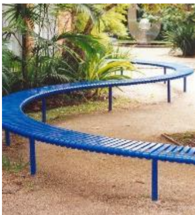
EM038 steel slat option