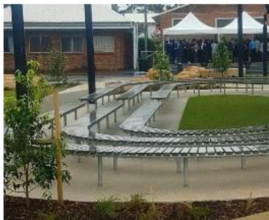
EM038 composite batten option