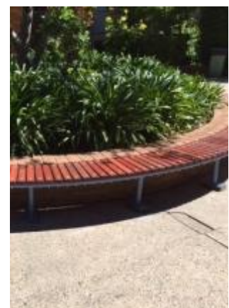
EM038 with powdercoated base option